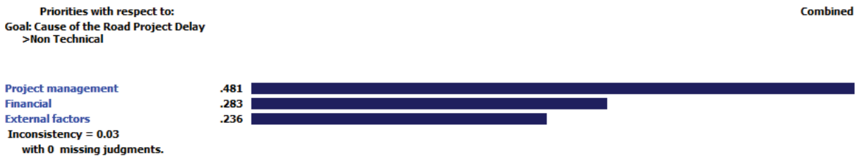
FIGURE 3. Factors causing delays from non-technical point of view

Based on the AHP synthesis, it reveals that the largest risk factor causing project delay is less quality control (X20). Furthermore, other significant factors that influencing project delay which has adjacent weights, namely late of material (X5) and lack of coordination among project staff (X19). On the other hand, factors that are considered less significant to project delay are workspace requirement (X12) and material storage area (X14).